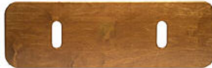
Standard Transfer Board