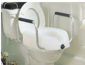
Raised Toilet Seat

Equipment to increase safety and independence in the bathroom