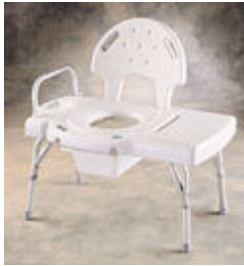
Bench with commode

It is very difficult for patients with ALS to get in and out of the shower without possibility of falling and injuring themselves. The shower chair plays an important role in preventing injuries.