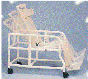
Tilt in space shower chair

Equipment to increase safety and independence in the bathroom