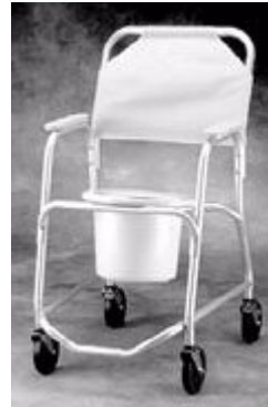
Mobile shower chair